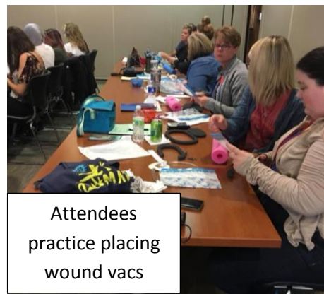
Attendees practice placing wound vacs