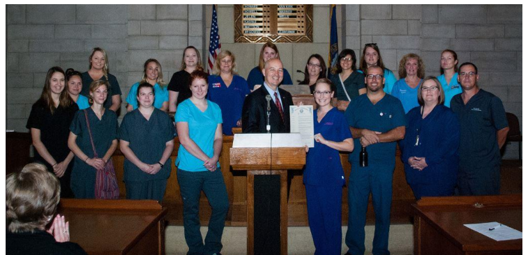
2015 National Surgical Technologist Week Proclamation Signing by Governor Pete Ricketts

On September 7 th at the state capitol in Lincoln, Governor Pete Ricketts will sign an official proclamation to designate September 18-24, 2016 as National Surgical Technologists Week in Nebraska. Please join us at 9:45am in the Warner Chamber for this ceremony.