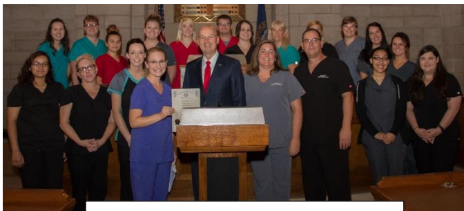
2016 Proclamation Signing

Dates for the 2018 AST National Conference in Orlando, Florida have been set for May 30- June 2 nd . We are always looking for state assembly members to serve as delegates/alternates at AST National Conference and will be electing these positions at the winter 2018 workshop. Mark your calendars now if you are interested in attending and representing your state assembly.